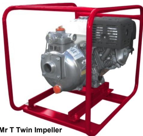
Mr T Twin Impeller